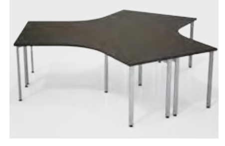
3-Way Pod: Table size options are 24" D x 48" W or 30" D x 60"W. Add ^{1}/_{2} rounds to the table ends of the 120 for a manager or training space.