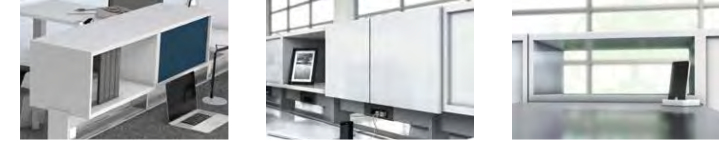
Modular components install in a snap – they slide and lock into place. Overhead Cabinets are offered with or without frosted glass or laminate doors, or as an open pass-through. Tack Panels or Dry Erase boards fit on the reverse side of cabinets.