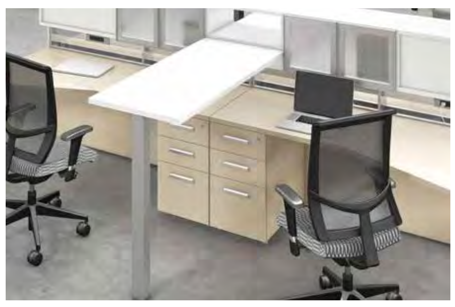
Standing-height work surfaces invite collaboration and promote movement.