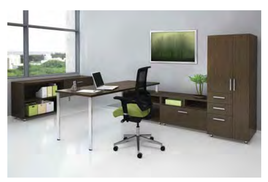
Utilizing the flexibility of the e5 components, you can create any number of private suites that provide solutions for an efficient office space.