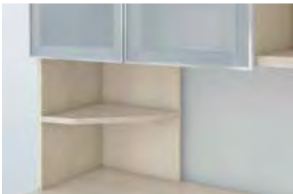
Overhead Cabinets may be supported by Corner Units with shelves or Storage Modules.