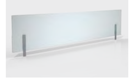
Above Surface Acrylic Privacy Panels can be mounted on top of surface (tables, beltways, cabinets, etc.).

e5 120 Series creates the perfect team work environment solution. Configure multiple workstation together using the three basic elements: work surfaces, storage units and power/data solutions.