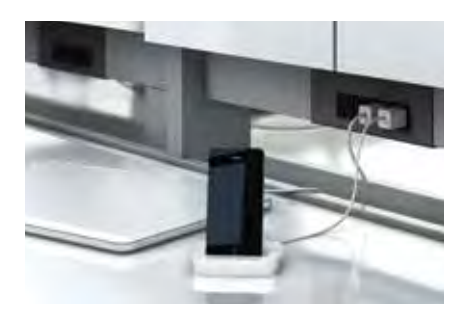
Power and data outlets are placed within arm's reach while an integral trough below the work surface conceals excess cabling.