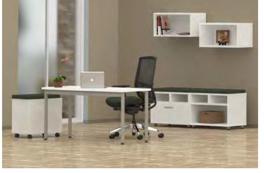
Select e5 bundles are ready to ship within three business days. Choose from 16 different bundles. Surfaces and storage elements in White or Raven.