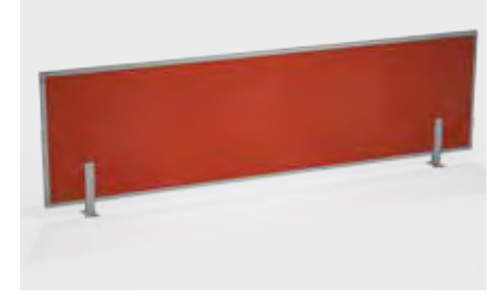
Above Surface Fabric Tack Panels. The space divider provides privacy and a functional tack board in one. Can be mounted on top of surface (tables, beltways, cabinets, etc.).