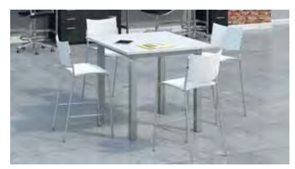
Standing-Height Square Tables. 11/8"Thermally Fused Laminate worksurfaces available in 6 colors with matching 2mm PVC edging.