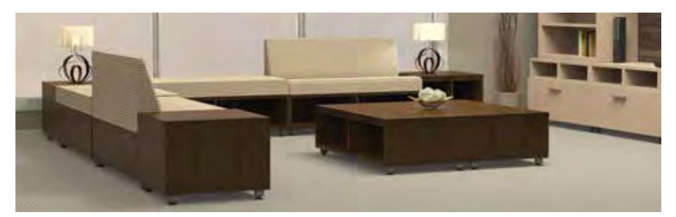
Additional features of the Banca series include open bases with laminate table tops to create a companion coffee table, taller laminate corner tables and end tables are also available.

A perfect seating solution to accompany the e5 desking series, Banca sofa seating combines laminate bases with soft cushions to create comfortable, functional meeting spaces that invite interaction. The seat bases are ordered separately from seat cushions, benches and tabletops. Bases offered with e5 cabinet legs (Silver, Black and White) or casters (Black only). Tables can be used in a corner, between benches or workstations, or as an end or coffee table. Upholstered seats and benches are available in all Momentum fabrics and COM*.