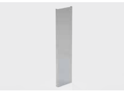
Leg Cover Kit accessory creates a clean finished look. Used with plain and surface power configurations only. Not for use with beltways.

e5 Easy-to-Afford option for any office. Because it's easily reconfigured, when adding workers and transforming work environments, you can re-purpose components into entirely new applications and expand office layouts with minimal disruption. Bulk up storage. Diversify function. Add more power, anywhere you want it. The 120-Degree e5 Workstation Pods have three power options - workstations with no cutouts, with surface power module cutouts (power modules are ordered separately), or with power beltways. Whatever your needs, now and in the future, you can count on e5 for an easy solution.