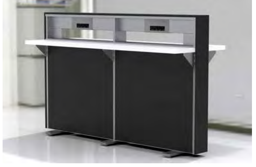
When using the optional foot kit with the Technology Wall you can create a freestanding charging station with counter-height table.