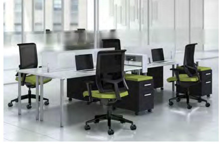
Open workstations can be set up in groups which allow you to take advantage of the Technology Beltway as a shared power source.