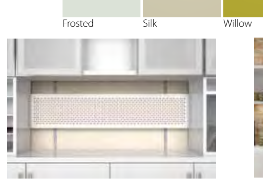
A magnetic Tackboard spans between vertical components to display notes, photos and art.