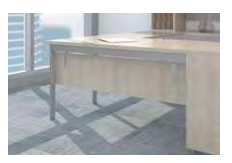
Easy-to-attach acrylic or laminate Modesty Panels are available for all standard configurations.

e5's common-sense approach to building a workspace makes it just as Easy to Specify private offices as collaborative environments. A variety of freestanding and wall-mounted components let you create near-endless configurations, in colors and finishes that range from traditional to ultra-modern. Use e5 throughout your office to create a unified look, feel and function while enhancing your Easy-to-Reconfigure flexibility.