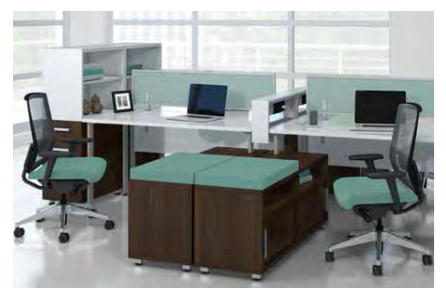
With e5 you can create multi-person workstations by simply connecting tables together. Top mounted acrylic or fabric screens act as privacy panels. Power up your workstation with the addition of a Beltway and Power Kits. Finish with storage solutions that provide easy access.