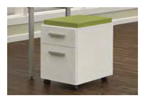
The Mobile Pedestal provides convenient mobile storage space and the cushion top allows for impromptu touchdown meetings.