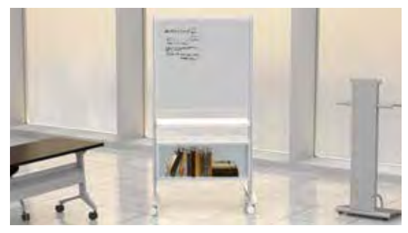
Keep Mobile Wall has the same advantages of Keep Modular with the bonus feature of mobility.